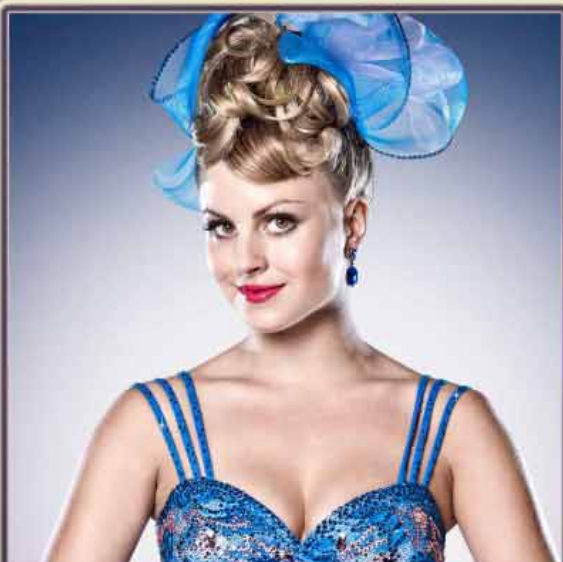
TINA O'BRIEN "The Soap Sweetheart"

Tina brings her own unique brand of sexy and cute. One of Corrie's favourite faces since she was 16 years old, this hard working mum is somebody the nation loves and can relate to.