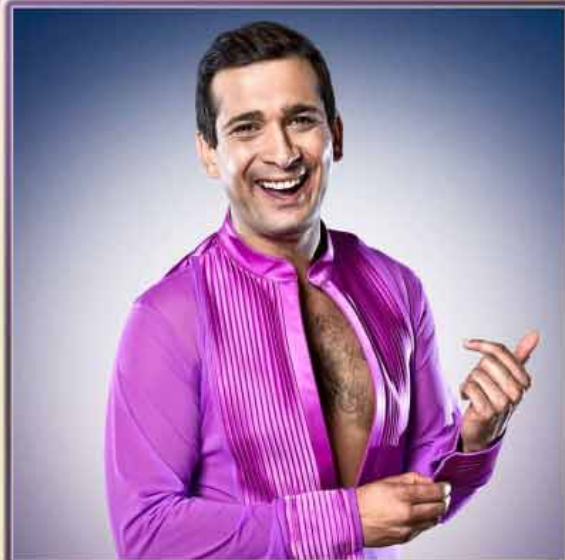
JIMI MISTRY "The Movie Star"

The live shows and finishing Holby City around the same time! I'm going to be working so hard but I'm just so excited to be part of something so brilliant and head on a new personal journey.