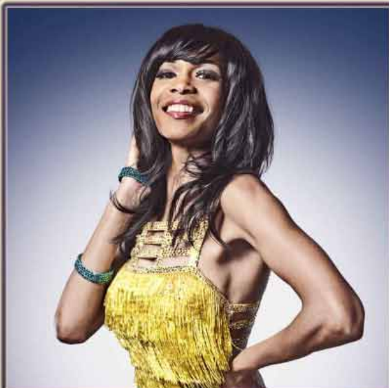
MICHELLE WILLIAMS "The International Pop Diva"