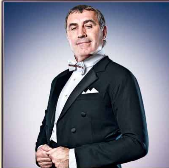
PETER SHILTON "The Sporting Legend"

For me, I'm nervous about forgetting the steps or going blank, quite likely in fact.....that would be a nightmare on live TV!