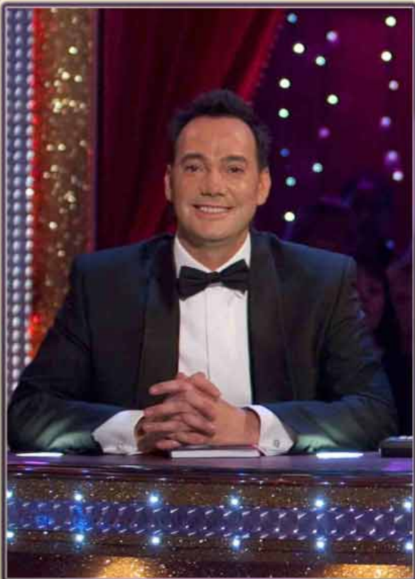
CRAIG REVEL HORWOOD

Craig Revel Horwood doesn't pull any punches when it comes to giving his opinion. He is a notoriously hard judge to please, but you wouldn't expect any less from a top theatre choreographer.