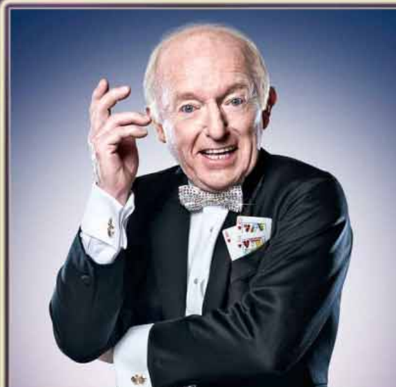
PAUL DANIELS "The Blast from the Past"

He's a 72 year old national treasure and the consummate performer. When it comes to Ballroom we hope he'll be more magic than tragic.