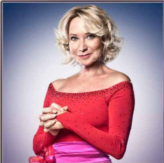
FELICITY KENDAL "The Nation's Most Loved Leading Lady"

Felicity is theatrical royalty and one of the UK's most loved actresses. Timelessly charming she guarantees us warmth and humour. She is a 'real' star whose performances will be unmissable.