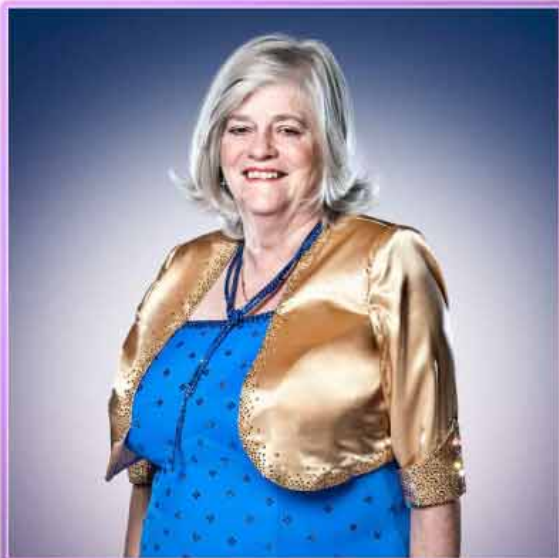
The Rt. Hon ANN WIDDECOMBE "The Wild Card"