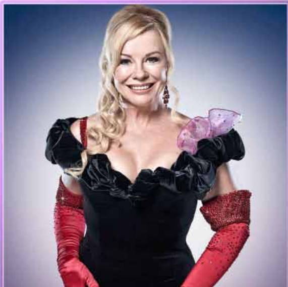
PAMELA STEPHENSON "The Chameleon"

From 'Not the 9 O'clock News' funny girl to acclaimed Doctor of Psychology, Pamela is never one to be predictable. Stepping back into the spotlight, we'll always be wondering what she'll do next.