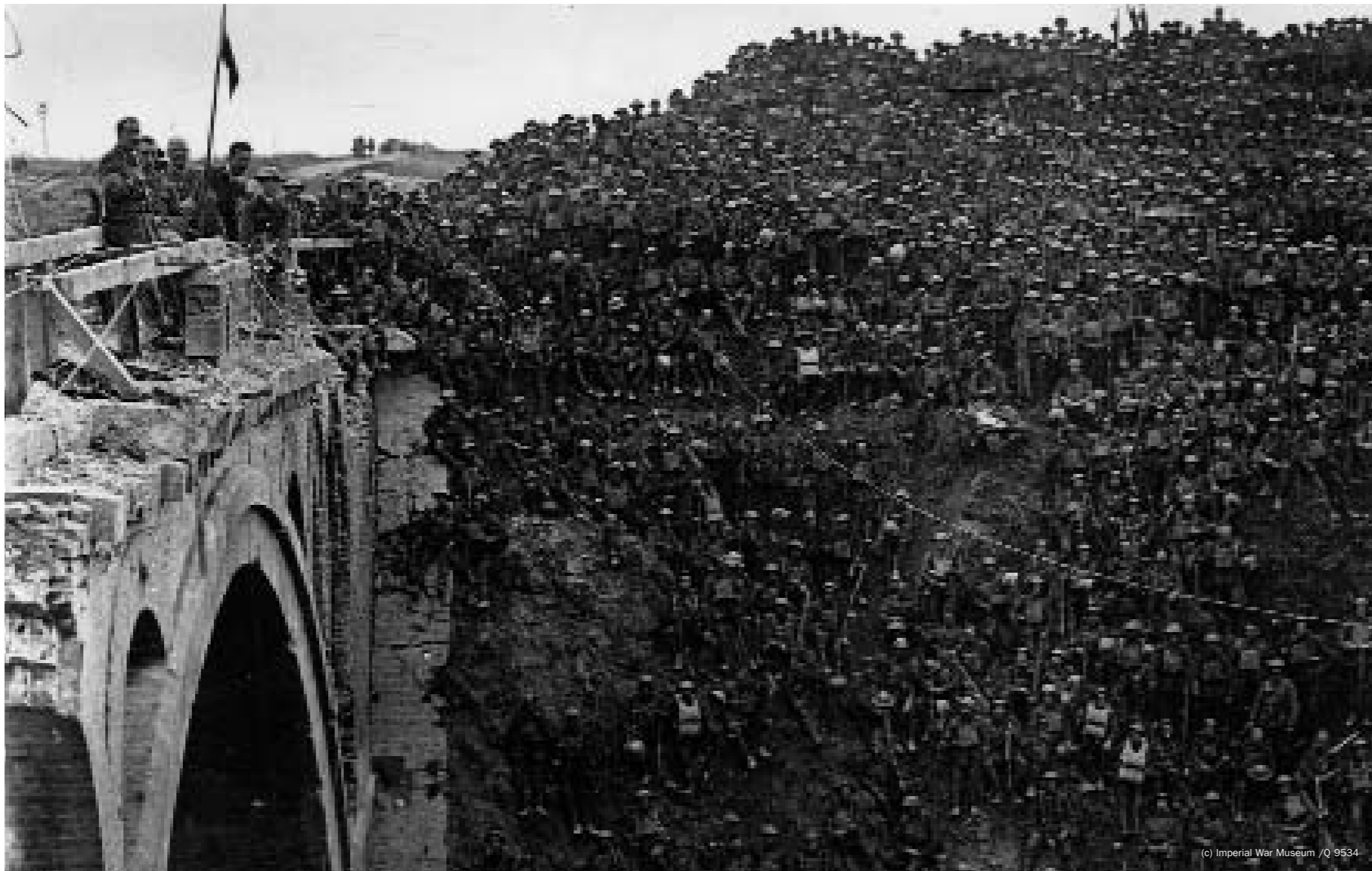
(c) Imperial War Museum / Q 9534