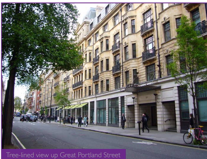
Tree-lined view up Great Portland Street

A draft report aiming to improve the quality and character of the public spaces around Fitzrovia/East Marylebone is currently out for consultation. Produced by ARUP at the request of the charity Westminster Tree Trust, the report is designed to facilitate local tree planting while creating a more unified and attractive urban design in the area following the guidelines of Westminster's Public Realm Strategy. To find out more and comment on the proposals, please visit: www.wlwtrees.wordpress.com/2011/11/01/fitzrovia-forest/