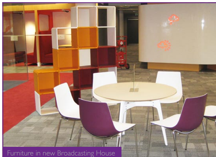
Furniture in new Broadcasting House

On the newsroom floor, the set and lighting for the BBC news channel and bulletins is under construction, in readiness for the first live news broadcasts later next year.