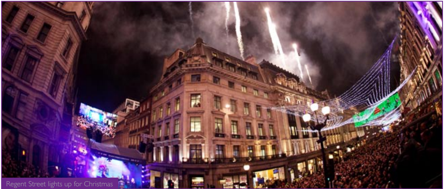
Regent Street lights up for Christmas